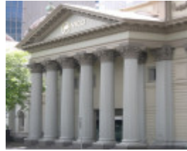
FORMER BAPTIST CHURCH HOUSE SOHE 2008