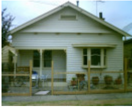
67 Yuille Street, Geelong West