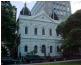
east melbourne synagogue albert street east melbourne front view oct1999