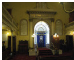
Interior towards Ark