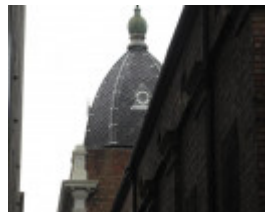
Repaired slatework to east dome Aug2014