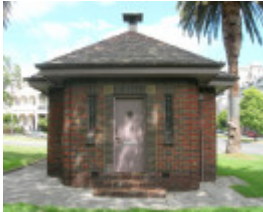
OLD MEN'S SHELTER SOHE 2008