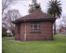
old men's shelter albert street east melbourne rear view