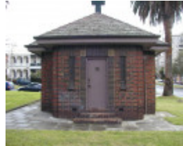
h00945 1 old men's shelter powlett reserve cnr powlett and albert east melbourne front view