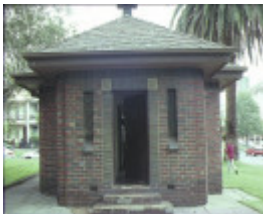
h00945 old men's shelter albert street east melbourne front view