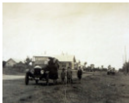
Ballarat Road, Meredith, c.1925.