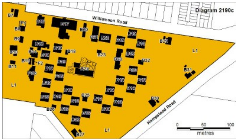
Former Maribyrnong Migrant Hostel Sept 2008 mz Plan C