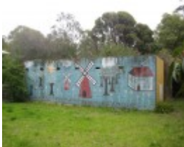
Former Maribyrnong Migrant Hostel Sept 2008 Dutch Mural