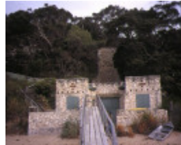
1 ilyuka lime kiln bathing box point king road portsea front view