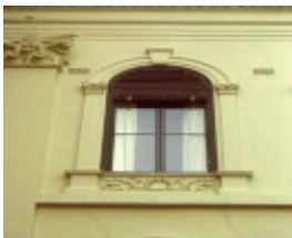
clarendon terrace window detail sw apr1999