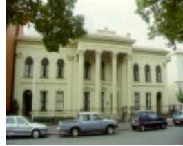
1 clarendon terrace front view sw apr1999