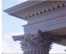
clarendon terrace 208 clarendon street east melb detail column