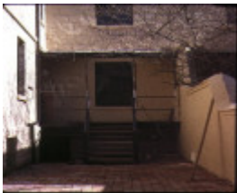
clarendon terrace 208 clarendon street east melb exterior rear