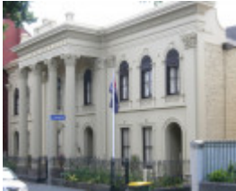
CLARENDON TERRACE SOHE 2008