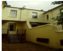
clarendon terrace rear dividing wall sw apr1999