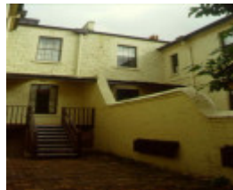
clarendon terrace rear dividing wall sw apr1999