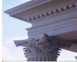
clarendon terrace 208 clarendon street east melb detail column