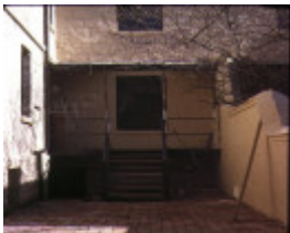
clarendon terrace 208 clarendon street east melb exterior rear