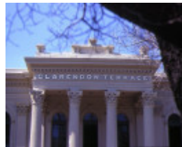
clarendon terrace 208 clarendon street east melb external entrance