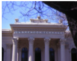
clarendon terrace 208 clarendon street east melb external entrance