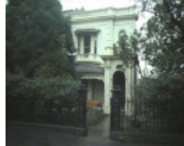
1 residence 193 george street east melbourne front view aug1985