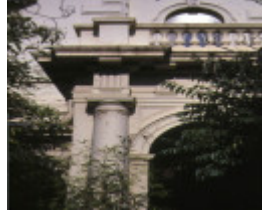
residence 193 george street east melbourne detail of entrance may1983