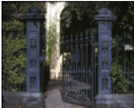
residence 193 george street east melbourne front gates may1983