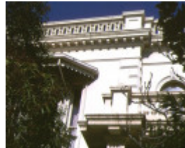
residence 193 george street east melbourne top floor detail may1983