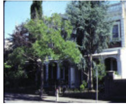
Nepean Terrace Gipps Street East Melbourne Exterior