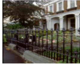
1 nepean terrace gipps street east melbourne facade january 2000