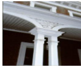
nepean terrace gipps street east melbourne verandah post january 2000