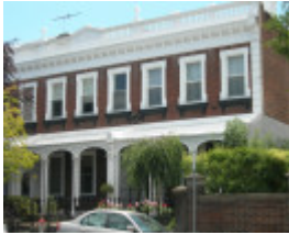
NEPEAN TERRACE SOHE 2008