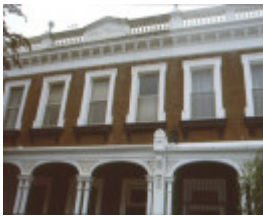
Nepean Terrace East Melbourne Front