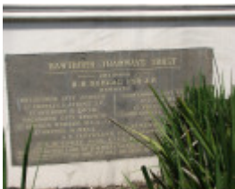
FORMER HAWTHORN TRAMWAYS TRUST DEPOT SOHE 2008