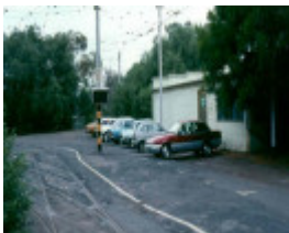
Former Hawthorn Tramway Depot Fan and Tower Wagon Shed