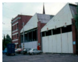
Former Hawthorn Tramway Depot from South West