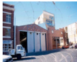
Former Hawthorn Tramway Depot During Redevelopment