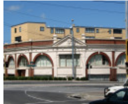
FORMER HAWTHORN TRAMWAYS TRUST DEPOT SOHE 2008