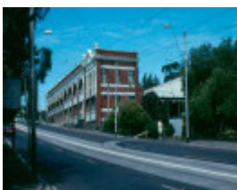
Former Hawthorn Tramway Depot from North West