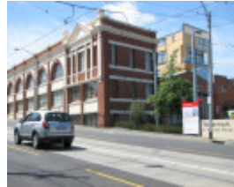
FORMER HAWTHORN TRAMWAYS TRUST DEPOT SOHE 2008