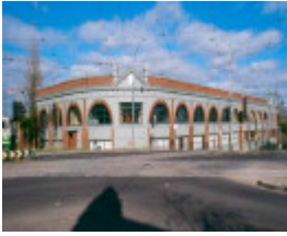
Former Hawthorn Tramway Depot 1990s