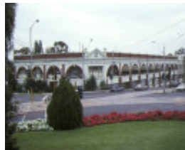
1 former hawthorn tramways trust depot front corner view