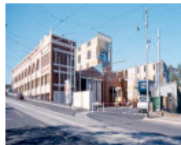
Former Hawthorn Tramway Depot During Redevelopment