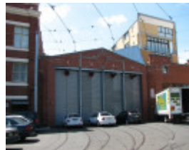
FORMER HAWTHORN TRAMWAYS TRUST DEPOT SOHE 2008