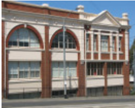
FORMER HAWTHORN TRAMWAYS TRUST DEPOT SOHE 2008