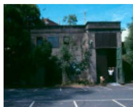
Former Hawthorn Tramway Depot Tower Wagon Shed