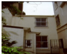
little parndon east melbourne h56 rear jan2000