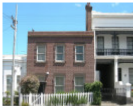
LITTLE PARNDON SOHE 2008