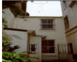
little parndon east melbourne h56 rear jan2000