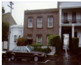
little parndon east melbourne h56 main facade jan2000