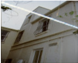
little parndon east melbourne h56 rear 1866 extension with tower room jan2000