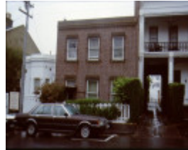
little parndon east melbourne h56 main facade jan2000