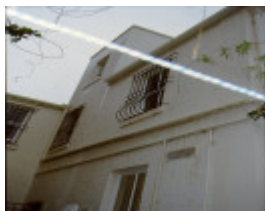
little parndon east melbourne h56 rear 1866 extension with tower room jan2000