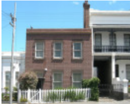
LITTLE PARNDON SOHE 2008