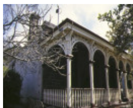
1 lauriston high street maldon front verandah sep1997