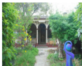
LAURISTON SOHE 2008