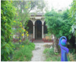
LAURISTON SOHE 2008