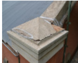
Before Photograph - Reference F3878 2014