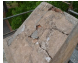
Before Photograph - Reference F3878 2014