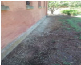
Before Photograph - Reference F3878 2014