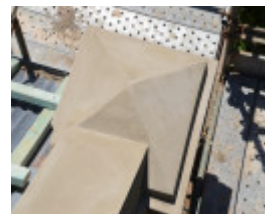
After Photograph - Reference F3878 2016