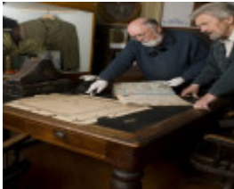
H1390 Maldon Museum and Archives Association Inc