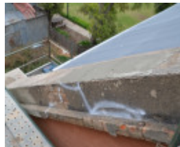
Before Photograph - Reference F3878 2014