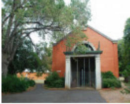
FORMER MARKET HALL AND ROYAL OAKS SOHE 2008