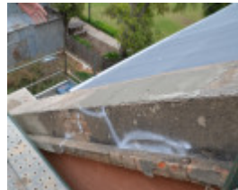
Before Photograph - Reference F3878 2014