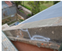
Before Photograph - Reference F3878 2014