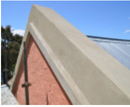
After Photograph - Reference F3878 2016