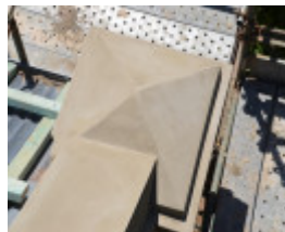
After Photograph - Reference F3878 2016