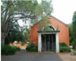
FORMER MARKET HALL AND ROYAL OAKS SOHE 2008