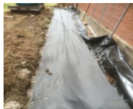
During Photograph - Reference F3878 2015