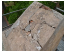
Before Photograph - Reference F3878 2014