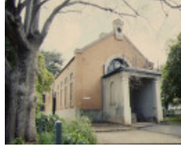
1 former market hall & royal oaks high street maldon side view aug1997