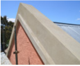
After Photograph - Reference F3878 2016