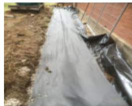
During Photograph - Reference F3878 2015