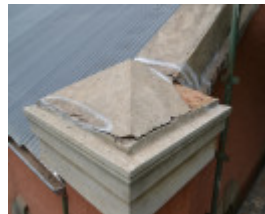
Before Photograph - Reference F3878 2014