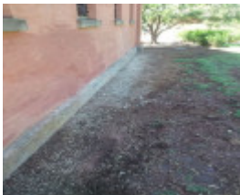
Before Photograph - Reference F3878 2014