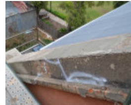
Before Photograph - Reference F3878 2014