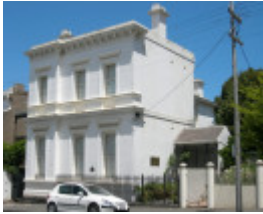
TOWN HOUSE SOHE 2008