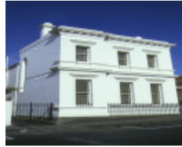
1 town house gipps street east melbourne front view