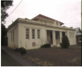
1 wonthaggi court house front view may1993