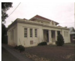
1 wonthaggi court house front view may1993