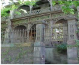
1 tasma terrace parliament place east melbourne entrance view oct1999