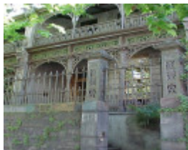
1 tasma terrace parliament place east melbourne entrance view oct1999