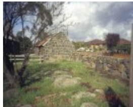
h00979 ziebells farm gardenia st thomastown barn outbuilding north end she project 2003