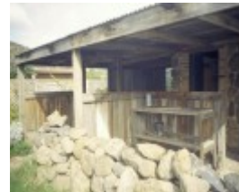
h00979 ziebells farm gardenia st thomastown drying shed east end she project 2003