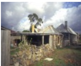
h00979 ziebells farm gardenia st thomastown drying shed she project 2003