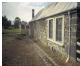
h00979 ziebells farm gardenia st thomastown farmhouse north wall stone gutter she project 2003