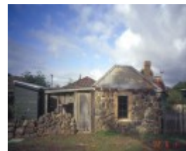
h00979 ziebells farm gardenia st thomastown smokehouse laundry outbuilding she project 2003