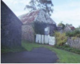
1 ziebell's farmhouse gardenia road thomastown front view