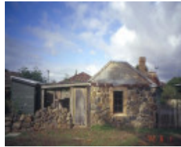
h00979 ziebells farm gardenia st thomastown smokehouse laundry outbuilding she project 2003