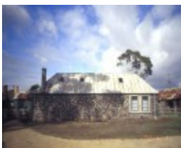
h00979 ziebells farm gardenia st thomastown view of farmhouse she project 2003