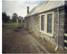
h00979 ziebells farm gardenia st thomastown farmhouse north wall stone gutter she project 2003