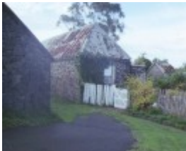
1 ziebell's farmhouse gardenia road thomastown front view