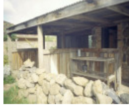
h00979 ziebells farm gardenia st thomastown drying shed east end she project 2003