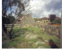
h00979 ziebells farm gardenia st thomastown barn outbuilding north end she project 2003