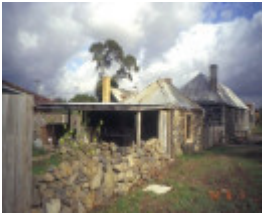
h00979 ziebells farm gardenia st thomastown drying shed she project 2003