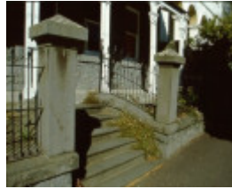
115 grey street east melbourne h58 steps april00