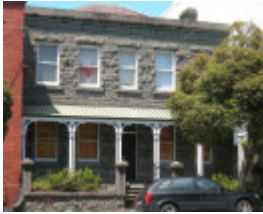
TOWN HOUSE SOHE 2008