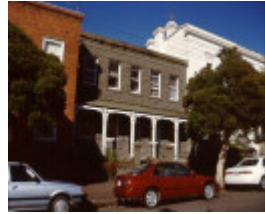
1 115 grey street east melbourne h58 april00