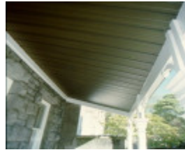
115 grey street east melbourne h58 steel decking verandah april00