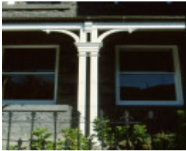
115 grey street east melbourne h58 verandah post april00