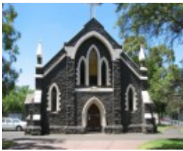
UNITING CHURCH SECOND WESLEYAN METHODIST CHAPEL SOHE 2008