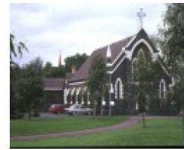
1 uniting church second wesleyan methodist chapel sydney road coburg front view