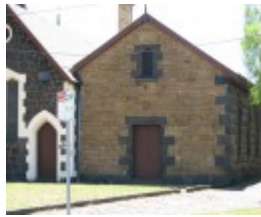
UNITING CHURCH SECOND WESLEYAN METHODIST CHAPEL SOHE 2008