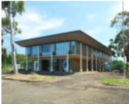
FORMER BP REFINERY ADMINISTRATION BUILDING SOHE 2008