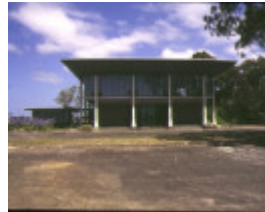
1 former bp refinery administration building the esplanade crib point front view jan1994