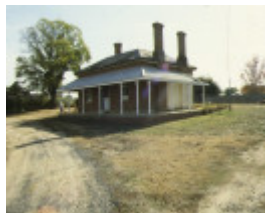
h00986 old1 former police superintendent s residence lislie street stawell front view may1993