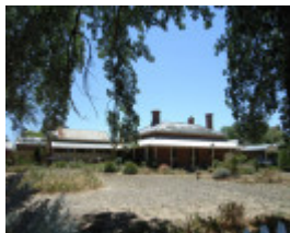
FORMER POLICE SUPERINTENDENT'S RESIDENCE SOHE 2008