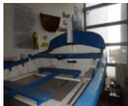
Portland Lifeboat - Towing bollard and sail master