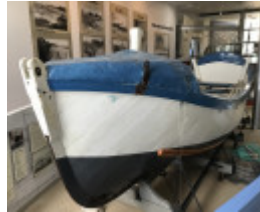
Portland Lifeboat - diagonal planks on other side