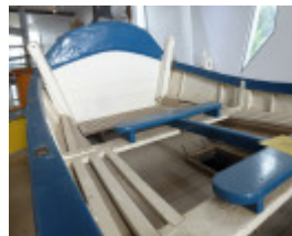
Portland Lifeboat - Quarter posts