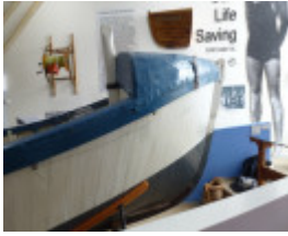
Portland Lifeboat - later cork whaleback