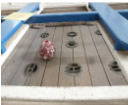
Portland Lifeboat - Wells Patent Lifeboat valves