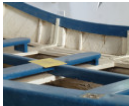
Portland Lifeboat - interior