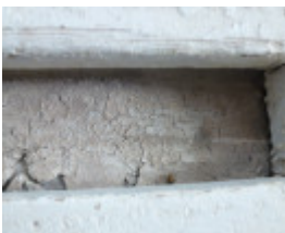
Portland Lifeboat - oiled fabric