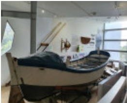
Portland Lifeboat - Stern