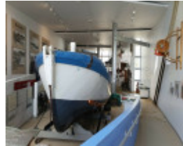
Portland Lifeboat - Bow