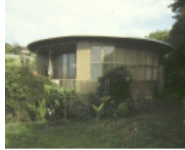
1 round house frankston front view jan1993