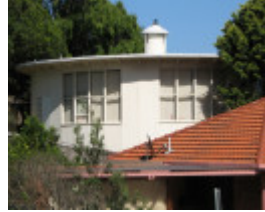
ROUND HOUSE SOHE 2008