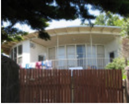
ROUND HOUSE SOHE 2008