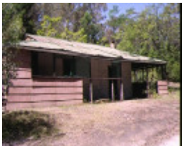
1 blue cottage/1 pise cottages zumsteins blue cottage front view