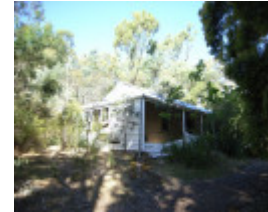
ZUMSTEINS RECREATION CENTRE SOHE 2008