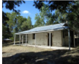
ZUMSTEINS RECREATION CENTRE SOHE 2008