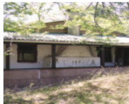
1 blue cottage/pise cottages zumsteins blue cottage side view