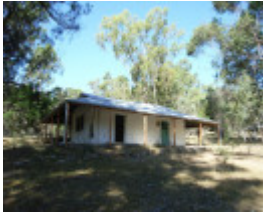
ZUMSTEINS RECREATION CENTRE SOHE 2008