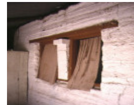
1 blue cottage/pise cottages zumsteins blue cottage window detail