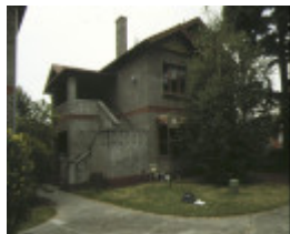
1 building 6/1 former ardoch educational centre dandenong road st kilda front view mar1993