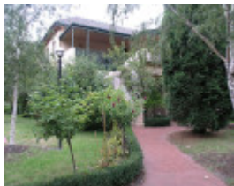
FORMER ARDOCH EDUCATIONAL CENTRE SOHE 2008