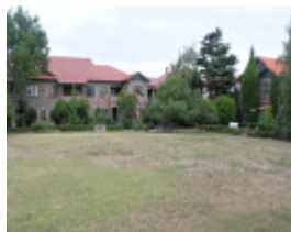
FORMER ARDOCH EDUCATIONAL CENTRE SOHE 2008