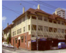
h01808 1 summerland mansions fitzroy st st kilda front elevation ac2 nov1999