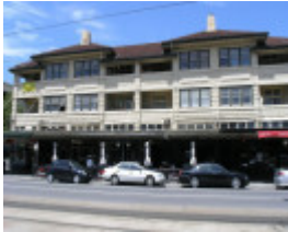
SUMMERLAND MANSIONS SOHE 2008