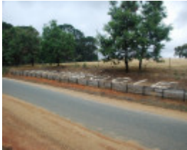
STRATHBOGIE AERIAL NAVAID SOHE 2008