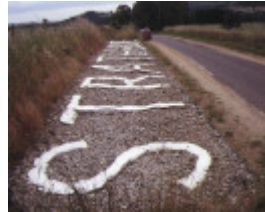
1 strathbogie air navaid strathbogie view from front end