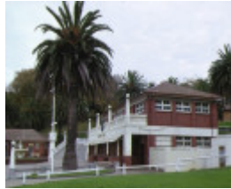
1 eastern beach bathing complex & reserve geelong cafe side view