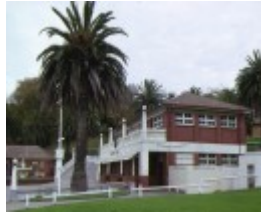
1 eastern beach bathing complex & reserve geelong cafe side view