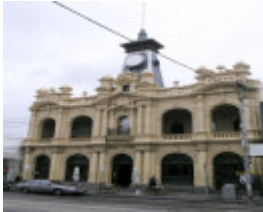
FORMER COLLINGWOOD POST OFFICE SOHE 2008