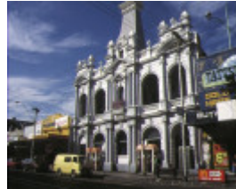
1 former collingwood post office smith street collingwood front elevation mar1993