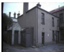
Burlington Terrace 27 Lansdowne Street East Melbourne Exterior Rear