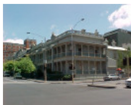
1 burlington terrace 400 384 albert street east melbourne street view oct1999