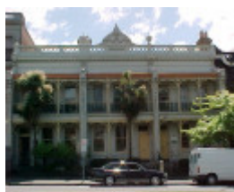
burlington terrace 400 396 albert street east melbourne front view oct1999