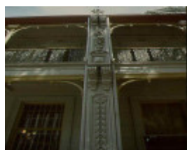
burlington terrace party wall