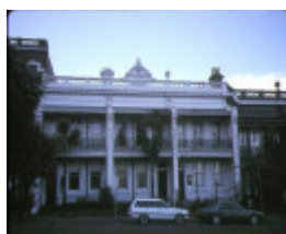
Burlington Terrace 23 Lansdowne Street East Melbourne Exterior Front