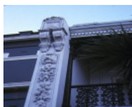
Burlington Terrace 25 Lansdowne Street East Melbourne Detail Front