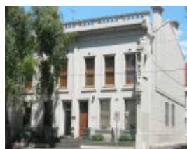
BURLINGTON TERRACE SOHE 2008