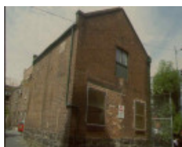
burlington terrace stables rear of 400 albert street