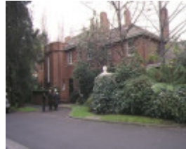
1 vice chancellors house university of melbourne parkville front view