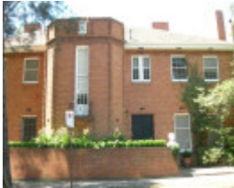
VICE CHANCELLOR'S HOUSE SOHE 2008