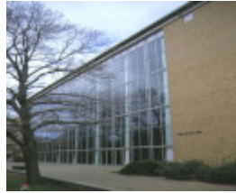
1 wilson hall university of melbourne parkville glass wall side view jul1993