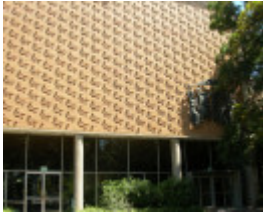
WILSON HALL SOHE 2008