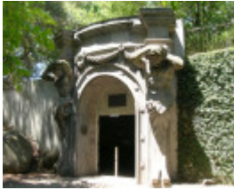
UNDERGROUND CAR PARK SOHE 2008