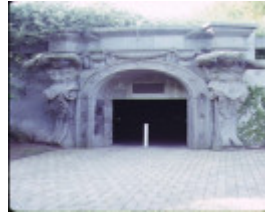
1 underground car park university of melbourne parkville walking entrance former colonial bank entrance may1989