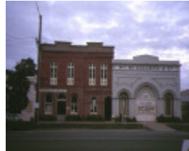
1 former permewan wright offices echuca front view