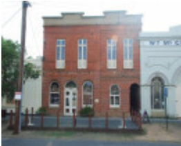
FORMER PERMEWAN WRIGHT OFFICES SOHE 2008