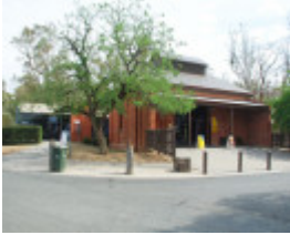
FORMER PUMPING STATION SOHE 2008