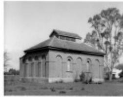
H1053 1 echuca pumping station 1964 slv