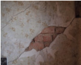
H1071 FORMER MURRAY HOTEL LHA 2015 5.JPG