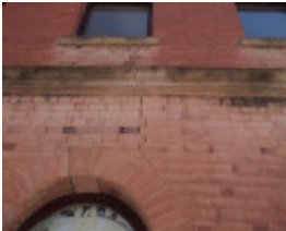
H1071 FORMER MURRAY HOTEL LHA 2015 2.JPG