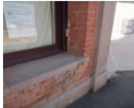
H1071 FORMER MURRAY HOTEL LHA 2015 3.JPG