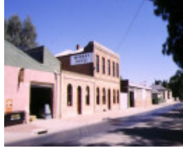
1 former murray hotel echuca streetscape 1998