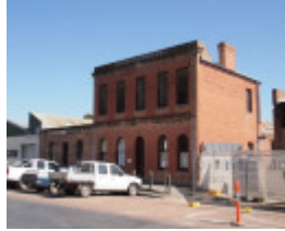
H1071 FORMER MURRAY HOTEL LHA 2015 1.JPG