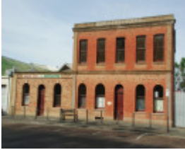
FORMER MURRAY HOTEL SOHE 2008