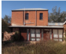
H1071 FORMER MURRAY HOTEL LHA 2015 4.JPG