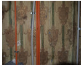
H1071 FORMER MURRAY HOTEL LHA 2015 6.JPG