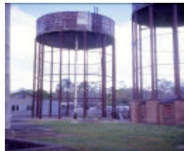
benalla water supply depot benalla steel tank she project 2003