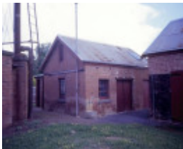
benalla water supply depot benalla carpenters shop she project 2003