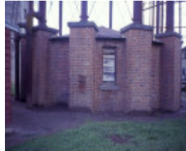
benalla water supply depot benalla blacksmiths shop she project 2003