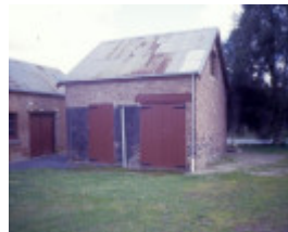
benalla water supply depot benalla pump shed she project 2003