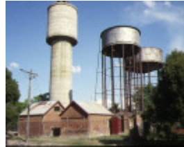
1 benalla water system benalla view of property