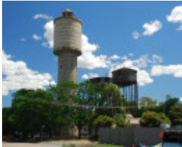
BENALLA WATER SUPPLY DEPOT SOHE 2008