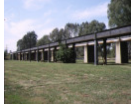
1 rail bridge benalla length of bridge apr1994