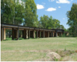
RAIL BRIDGE SOHE 2008