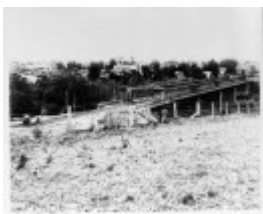
Undated photo Chandler Highway Bridge.jpg