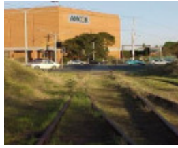
Tracks at the former site of the Fulham Grange Station (now removed) approaching the Chandler Highway Bridge.jpg