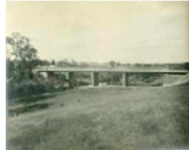
Railway bridge across the Yarra, Kew, 1891 (?) Kew.jpg