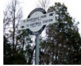
Parts of the former Outer Circle Railway have been converted into walking and cycling tracks. This sign is from the 'Anniversary trail'.jpg