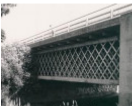
Bell Street Bridge, Coburg (1880) (Not in the VHR).jpg