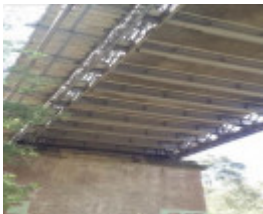
A view from the cycle path at the southern end of the bridge.jpg