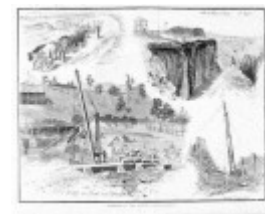
Sketches On The Outer Circle Railway, 'Bridge over the Yarra River at Alphington'. Melbourne: David Syme and Co. 1889.jpg