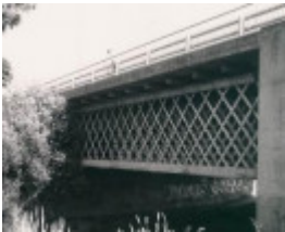
Bell Street Bridge, Coburg (1880) (Not in the VHR).jpg