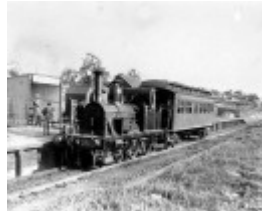
A steam train at the Ashburton Railway Station, circa 1900.jpg