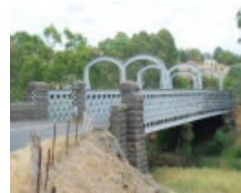
Mia Mia/Redesdale Bridge (1868) (VHR H1419).jpg