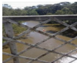
A detail of the cantilevered walkway looking west along the Yarra River.jpg