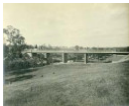
Railway bridge across the Yarra, Kew, 1891 (?) Kew.jpg