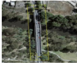
Extent of registration.jpg