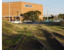
Tracks at the former site of the Fulham Grange Station (now removed) approaching the Chandler Highway Bridge.jpg