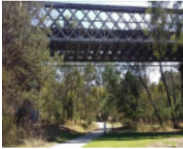
Chandler Highway Bridge