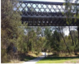
Chandler Highway Bridge