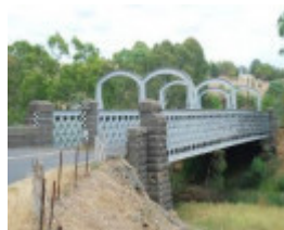
Mia Mia/Redesdale Bridge (1868) (VHR H1419).jpg