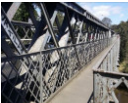
A view along the cantilevered walkway from the north looking south.jpg