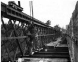
Chandler Highway Bridge construction works .jpg