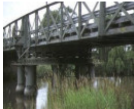
Sale Swing Bridge (1883) (VHR H1438).jpg