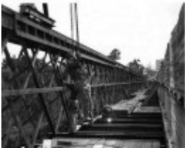
Chandler Highway Bridge construction works .jpg