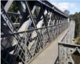
A view along the cantilevered walkway from the north looking south.jpg