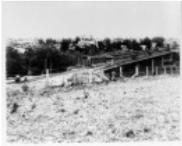
Undated photo Chandler Highway Bridge.jpg