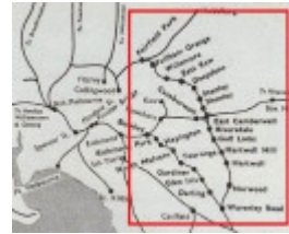
A diagram of the Outer Circle Railway Line with the Chandler Highway Bridge denoted.jpg