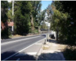
Chandler Highway Bridge looking to the south (City of Boroondara) from the northern side of the bridge (City of Yarra).jpg