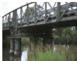
Sale Swing Bridge (1883) (VHR H1438).jpg