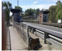
Chandler Highway Bridge looking to the north (City of Yarra) from the southern side of the bridge (City of Boroondara).jpg