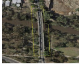
Aerial photo showing extent of registration