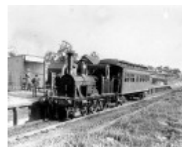
A steam train at the Ashburton Railway Station, circa 1900.jpg