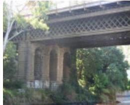
Hawthorn Bridge (1861) (VHR H0050).jpg