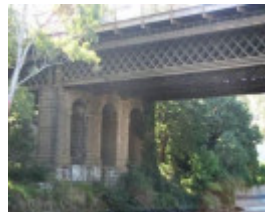
Hawthorn Bridge (1861) (VHR H0050).jpg