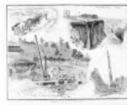
Sketches On The Outer Circle Railway, 'Bridge over the Yarra River at Alphington'.Melbourne: David Syme and Co. 1889.jpg