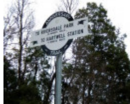
Parts of the former Outer Circle Railway have been converted into walking and cycling tracks. This sign is from the 'Anniversary trail'.jpg