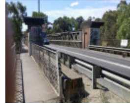
Chandler Highway Bridge looking to the north (City of Yarra) from the southern side of the bridge (City of Boroondara).jpg