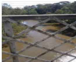
A detail of the cantilevered walkway looking west along the Yarra River.jpg