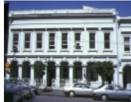
1 terrace 14 & 18 morrison place east melbourne front view nov1990