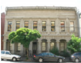
TERRACE SOHE 2008