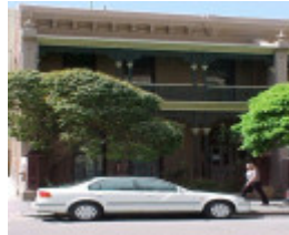
terrace 22 morrison place east melbourne entrance detail oct1999