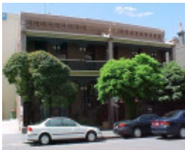
1 terrace 22 morrison place east melbourne front view oct1999