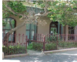
terrace 22 morrison place east melbourne front elevation oct1999