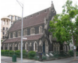
LUTHERAN CHURCH SOHO 2008