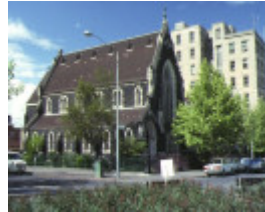
1 lutheran church external view