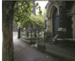
lutheran church external entrance