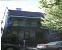
lutheran church manse front