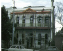
1 foynes powlett street east melbourne front view