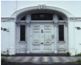
foynes powlett street east melbourne front entrance oct1980