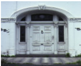
foynes powlett street east melbourne front entrance oct1980