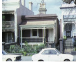
1 residence 130 powlett street east melbourne front elevation