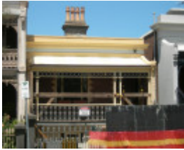
BUILDING SOHE 2008