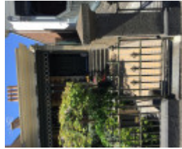
RESIDENCE October 2016