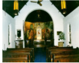
1 st james the less mt eliza