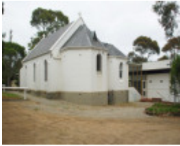
ST JAMES THE LESS ANGLICAN CHURCH SOHE 2008