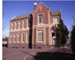
1 former yarra park primary school no1406 punt road east melbourne front view