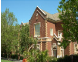
FORMER YARRA PARK PRIMARY SCHOOL NO. 1406 SOHE 2008