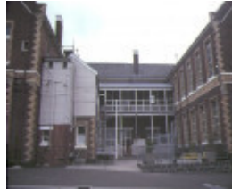
former yarra park primary school no1406 punt road east melbourne rear view may 1985