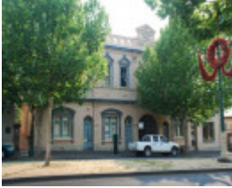
BENDIGO TEMPERANCE HALL SOHE 2008