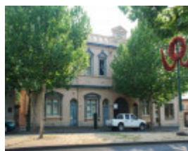
BENDIGO TEMPERANCE HALL SOHE 2008