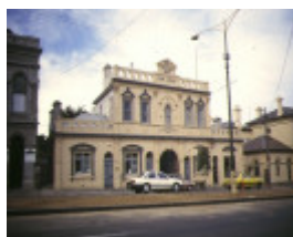
1 bendigo temperance hall bendigo front view apr1997