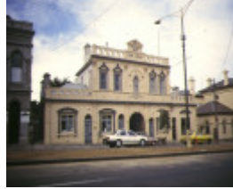
1 bendigo temperance hall bendigo front view apr1997