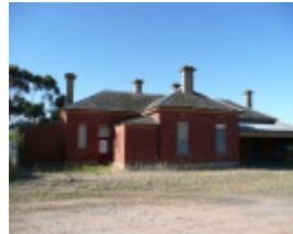
AVOCA RAILWAY STATION SOHE 2008