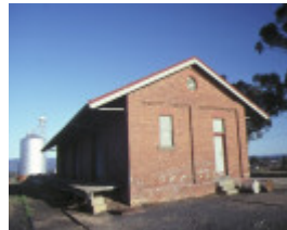
avoca railway station york avenue avoca goods shed aug1984