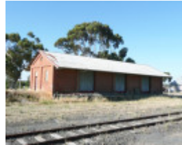
AVOCA RAILWAY STATION SOHE 2008