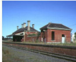
1 avoca railway station york avenue avoca trackside view nov1993