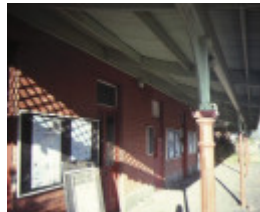
avoca railway station york avenue avoca platform view aug1984