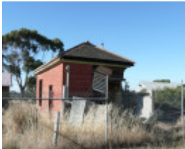
AVOCA RAILWAY STATION SOHE 2008