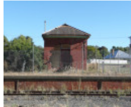
AVOCA RAILWAY STATION SOHE 2008