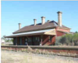
AVOCA RAILWAY STATION SOHE 2008