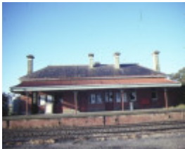
avoca railway station york avenue avoca front view aug1984