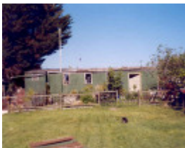
h01297 the grange belgrave street coburg stables she project 2003