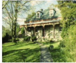
1 the grange belgrave street coburg front view sep1996