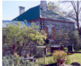
h01297 the grange belgrave street coburg side view she project 2003