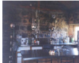
h01297 the grange belgrave street coburg kitchen she project 2003