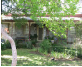
THE GRANGE SOHE 2008