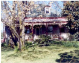
h01297 the grange belgrave street coburg front view she project 2003