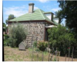
THE GRANGE SOHE 2008